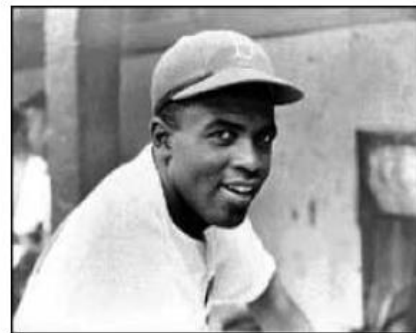
the color of his skin