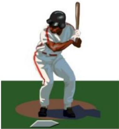
how he played baseball