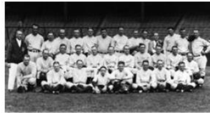
play for a major-league team