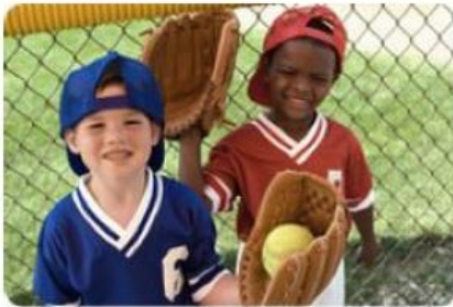
play for a minor-league team

4. Jackie Robinson was the first African American to do what?